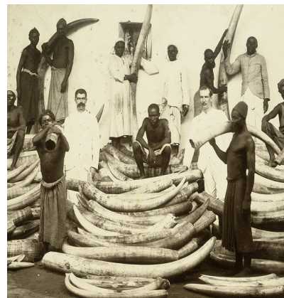
02 Ivory trade, East Africa, 1880–90s. www.bassenge.com.

For centuries ivory was a global commodity, shaping material cultures beyond elephant habitats. This highly prized material comes from the tusks and teeth of several animals: elephants, hippopotami, walruses, warthogs, sperm whales, and narwhals, as well as extinct mammoths and mastodons. However, ivory from elephant tusks—incisor teeth—is considered the most valuable due to its large size. Why is this dental tissue so cherished across different cultures? Associated with purity and chastity due to its whiteness, ivory was aptly used in Christian devotional art. As a craft material, it is valued for its durability and easiness to carve in fine detail. Artifacts such as carved figures, tools, musical instruments, and weapons made with the use of ivory fill the shelves and storage rooms of museum collections. Before the introduction of plastic, ivory was also widely used in manufactured everyday objects like cutlery handles, billiard balls, piano keys, buttons, jewelry, and other decorative items. The piano industry only abandoned ivory as a key-covering