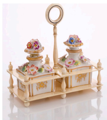
04 A pair of porcelain perfume bottles placed on an ivory stand. First half of the 19th century.

This enduring fascination with elephants turned their bodies into colonial trophies, dead or alive. While captive elephants were the hallmarks of European zoological collections, ivory became a luxurious commodity and an expression of wealth. At the turn of the twentieth century, patterns of ivory consumption were closely connected to the growing middle-class in Europe and the United States. As a status symbol ivory signaled elevation in social rank, especially for those whose belonging to European culture or even whiteness was in doubt.