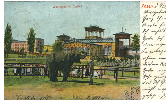
03 Postcard from the turn of the twentieth century featuring an Asian elephant performing in front on an audience.

“For centuries ivory was a global commodity, shaping material cultures beyond elephant habitats.”